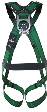
V-FORM Standard Harness with Quik-Fit™ buckles (P/N 10196642)