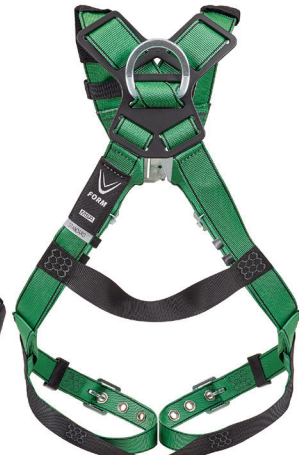
V-FORM Harness with Quick-Connect Racing-Style Buckle (P/N 10206058)