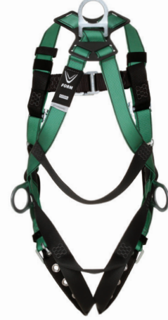
V-FORM Harness with front D-ring (P/N 10197207)