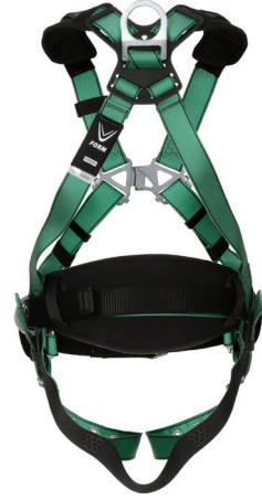
V-FORM Construction Harness (P/N 10197364)