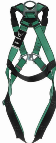
V-FORM Standard Harness with stainless steel hardware (P/N 10197234)