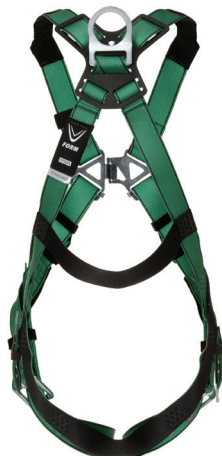
V-FORM Standard Harness with tongue buckles (P/N 10196642)